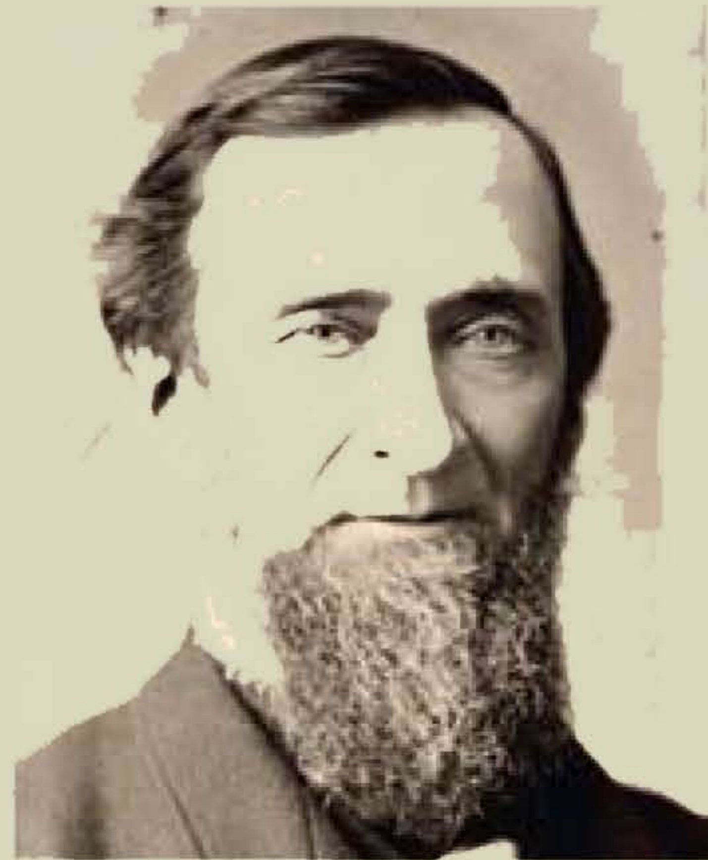
Redfield Proctor (1860), Vermont governor, Secretary of War, and U.S. Senator