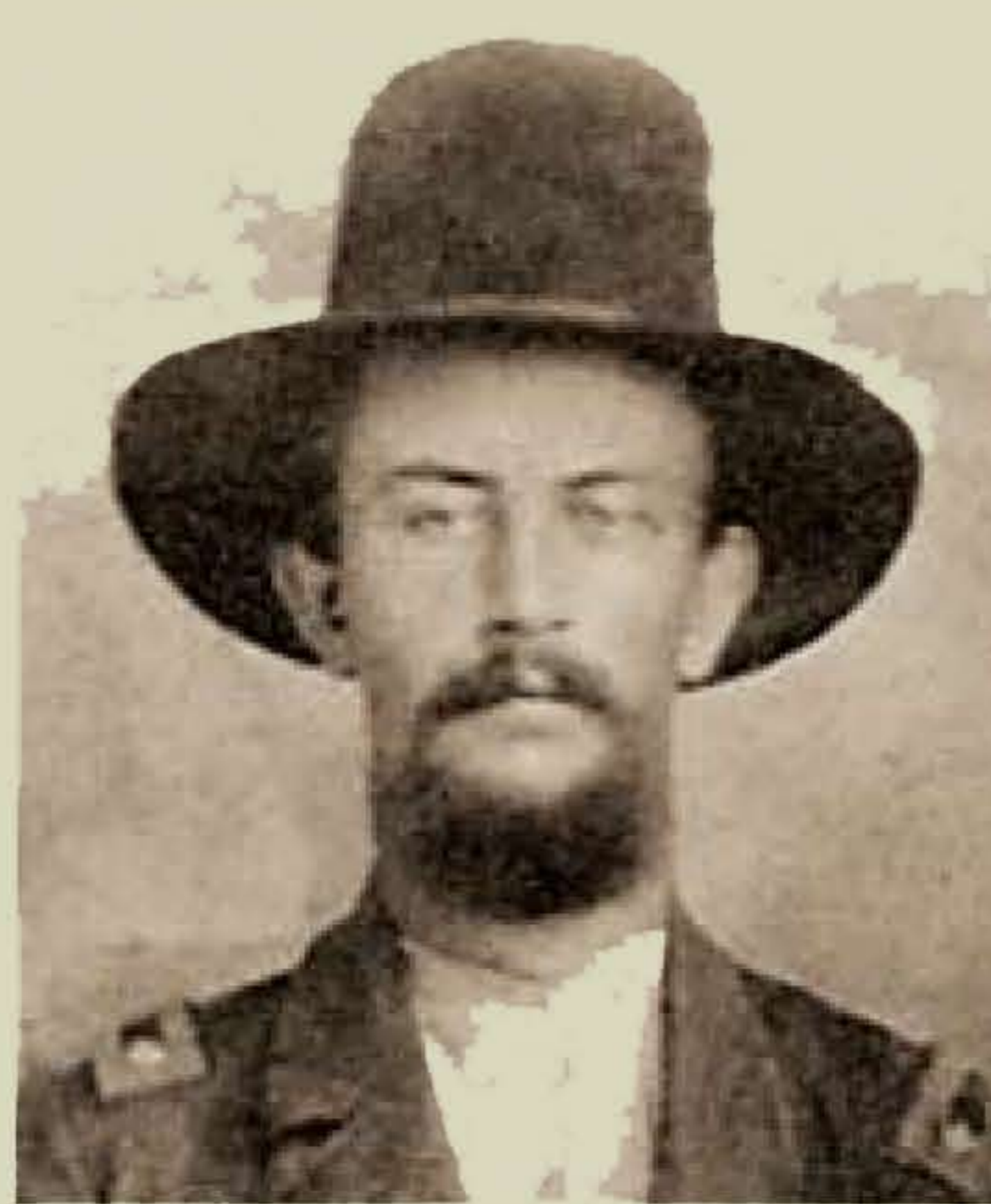
William F. Vilas (1860), U.S. Senator, Postmaster General, Secretary of the Interior